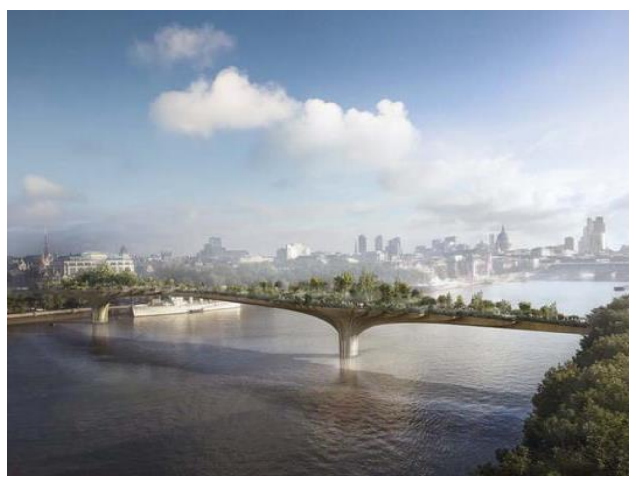
Designed park bridge over the River Thames in London.