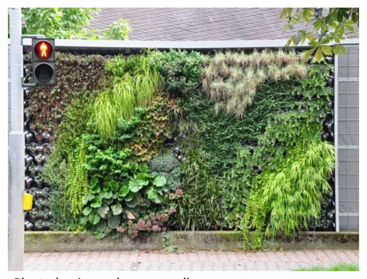
Planted noise and screen walls