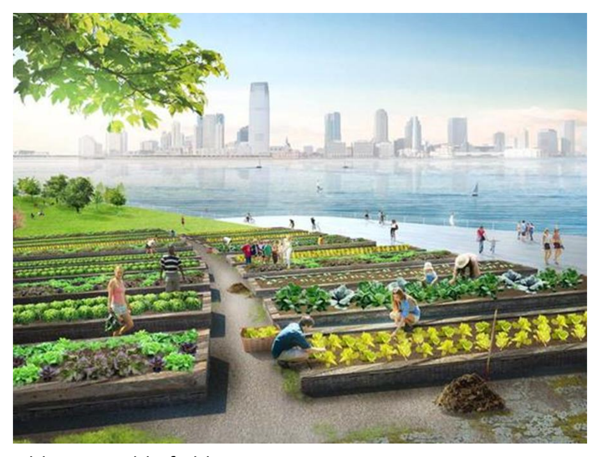
Public vegetable fields