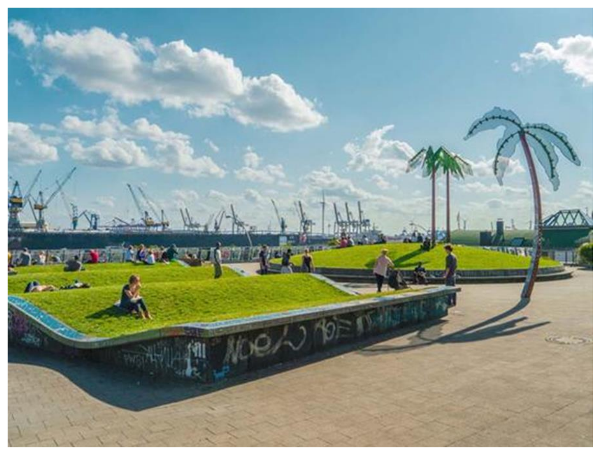
Green meadows at the Port of Hamburg