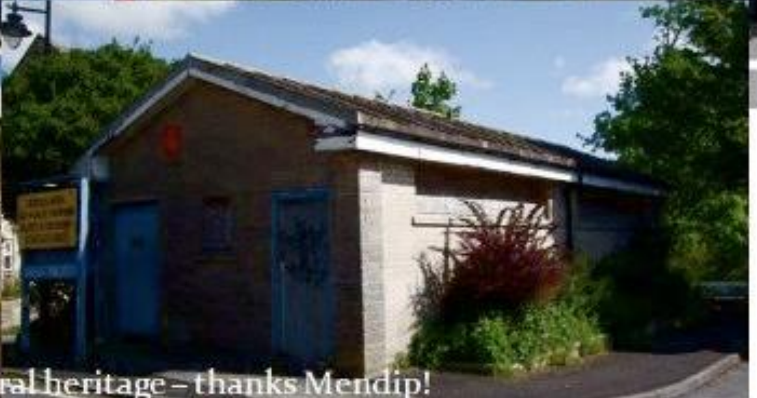
Frome's architectural heritage – thanks Mendip!